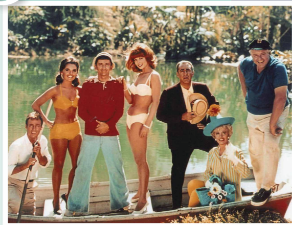
GOING TROPPO Dawn credits the show's cult success partly to the bond the castaways shared. Today she's as glamorous as ever

Her loveable Kansas farm-girl alter-ego had its roots very much in