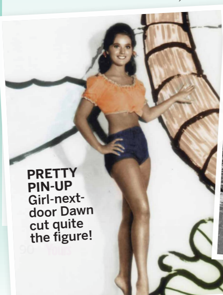
PRETTY PIN-UP Girl-next-door Dawn cut quite the figure!

Dawn will be a guest at Supanova Pop Culture Expo in the Gold Coast on April 9-10 and in Melbourne April 16-17. For more information, visit supanova.com.au